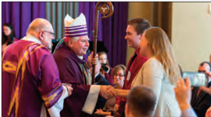
Confirmation

Catholic Educators and Catechists at the annual New Evangelization Convocation